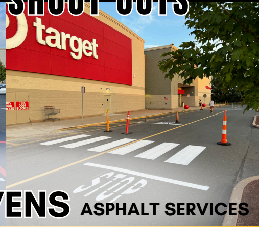
MICHAEL STEVENS ASPHALT SERVICES